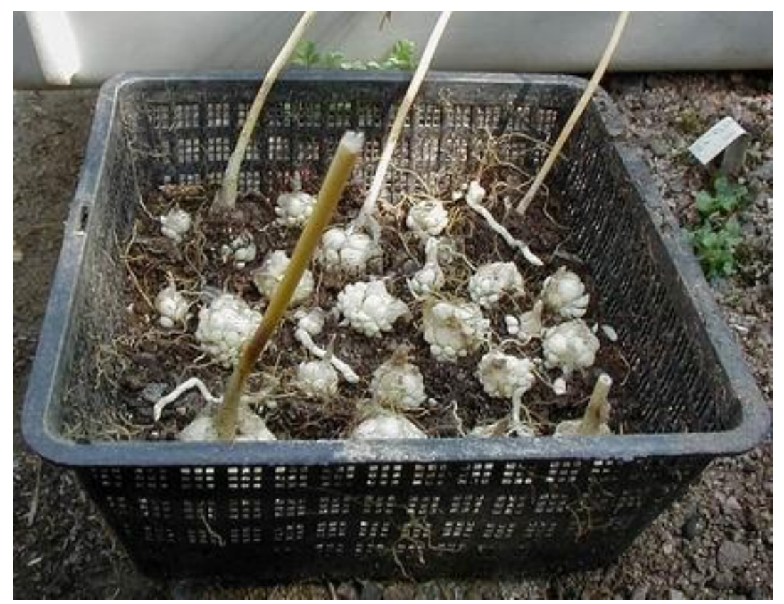
Fritillaria camschatensis in basket

We grow our Fritillaria camschatensis in plunge baskets as they much prefer to be outside where it is cooler and moister in the summer than under glass.