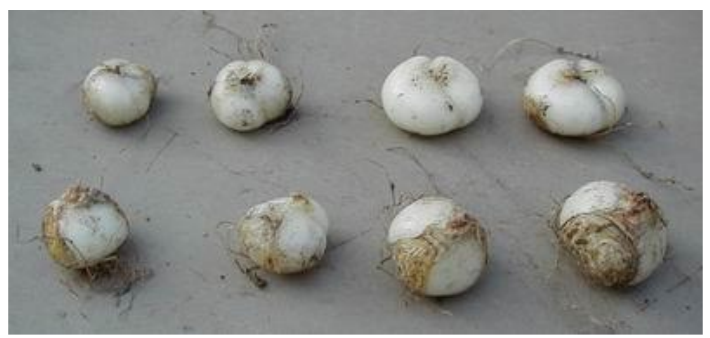
Fritillaria bulbs mixed

No matter how careful I am we always end up with stray frits getting mixed up in pots. Have I mentioned that I believe that if you grow frits in pots for long enough they will all turn into F. acmopetala or F. hermonis amana ?!! It is also inevitable if you are buying Frits in multiples, that you will occasionally get strays, it is a fact of life.