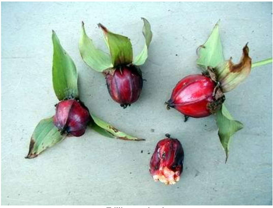
Trillium seed pods

Sometimes seed pods can be as attractive as the flowers, like these Trillium seed heads. The wasps do not seem to raid this one, in fact it is only T. ovatum that they go crazy for in our garden. I was telling some one how I separate out my trillium seeds from the sticky fruit and they said 'I wish you had told me that before', so here is how I do it.