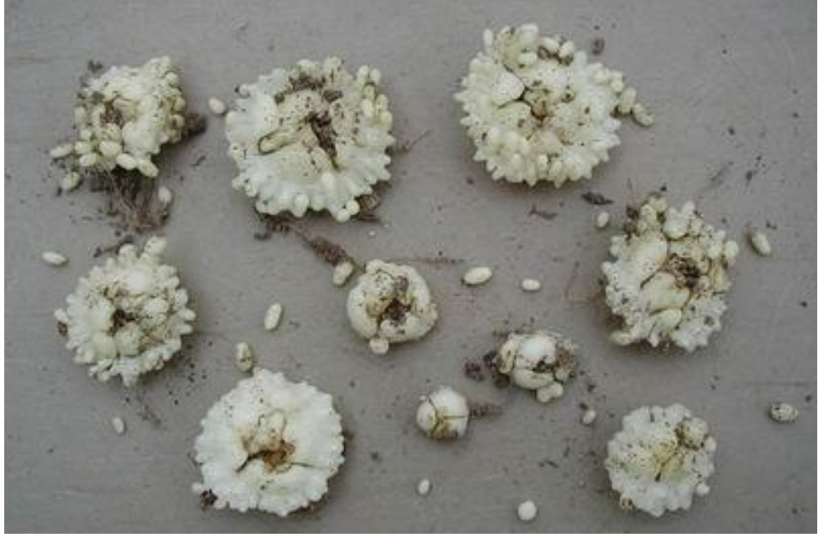
Fritillaria pudica bulbs

Sometimes you can detect a slightly different shape to the bulb when repotting. This is a pot of F. tubiformis (bottom row) that was invaded by F. hermonis amana (top) - luckily the tubiformis has a pointed top while F. hermonis amana has a flat top. Now I have a nice pot of tubiformis, a nice pot of hermonis amana and a pot of mixed rice!