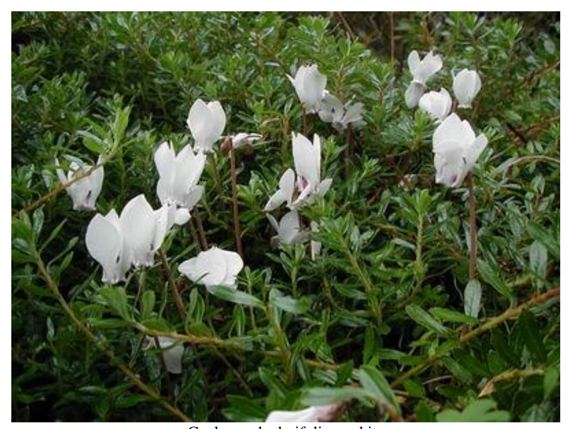
Cyclamen hederifolium white

I always think that it is a sure sign that summer is drawing to an end when Cyclamen purpurescens starts to flower, but it flowered very early this year the first flowers appeared more than three weeks ago - I do not think that summer is over yet. It has one of my favourite scents of all the flowers.